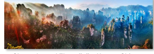
Changsha and Zhangjiajie, Hunan, China